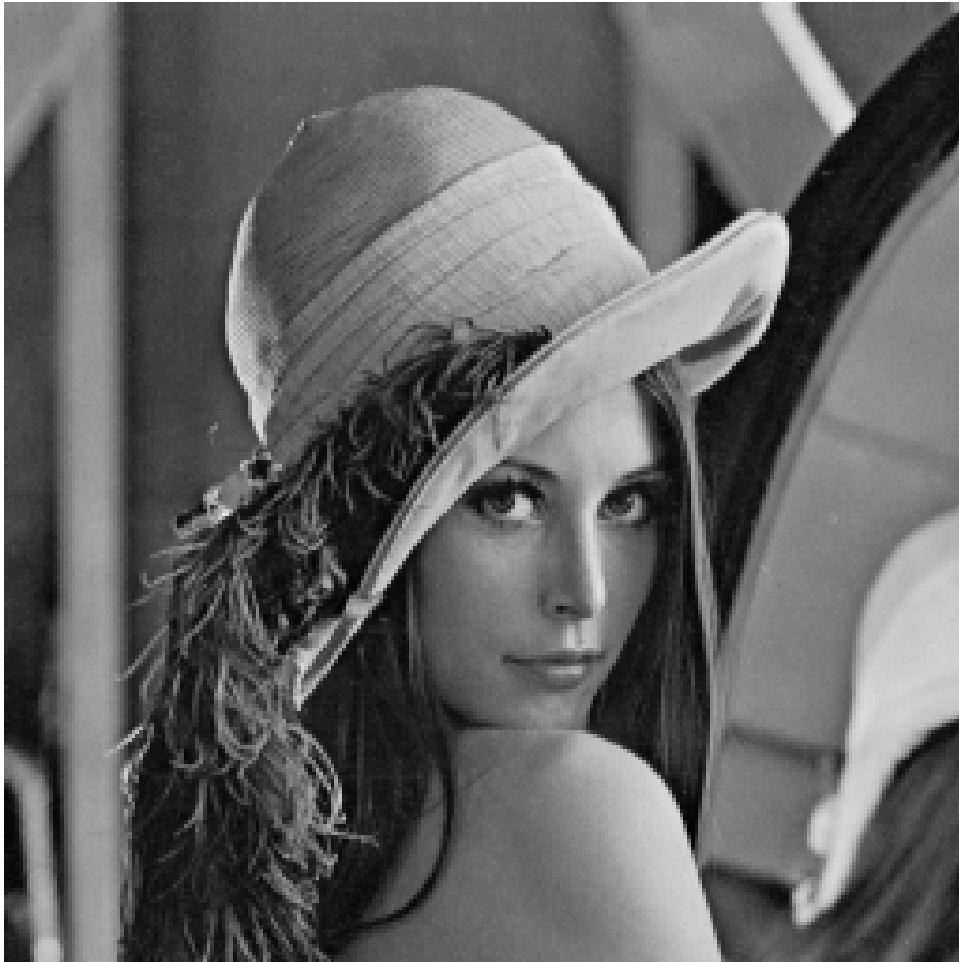
Figure 4.2: Exp4