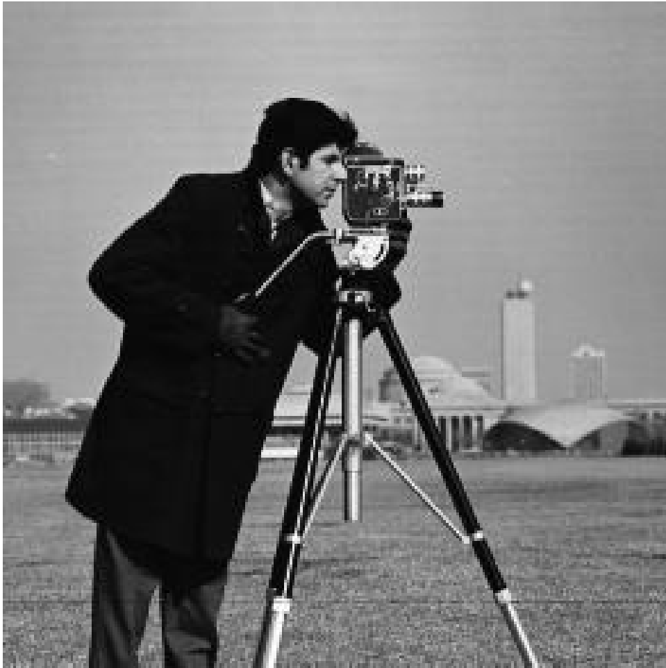
Figure 4.1: Exp4