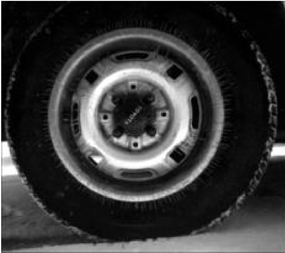
Figure 15.1: Exp15