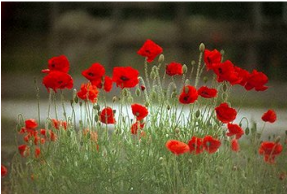
Figure 3.2: Exp3