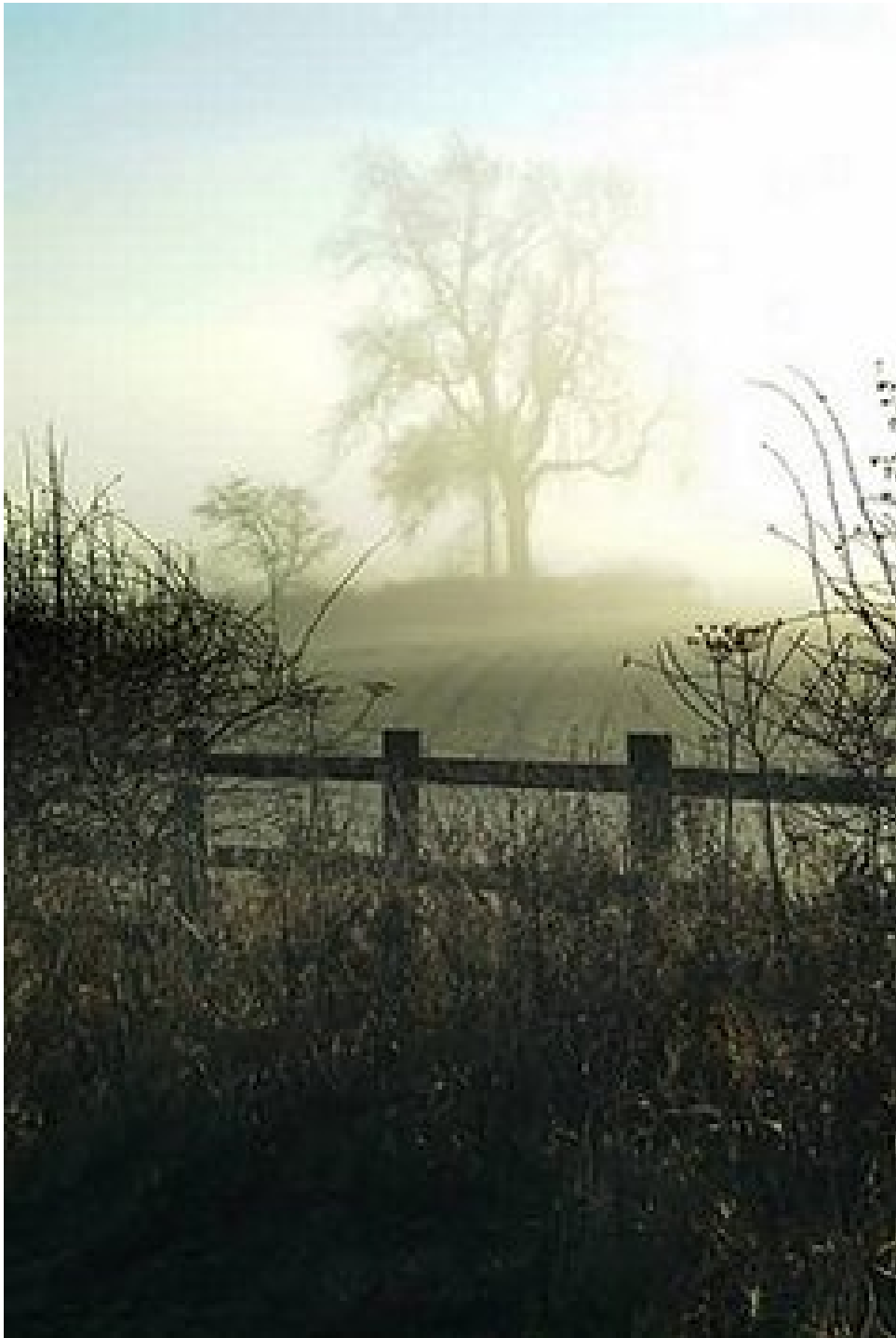
Figure 3.1: Exp3 13