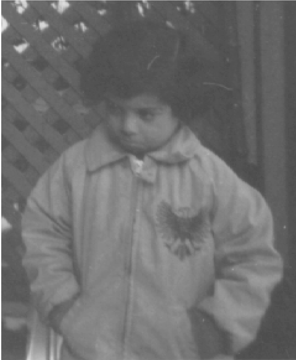
Figure 11.1: Exp11